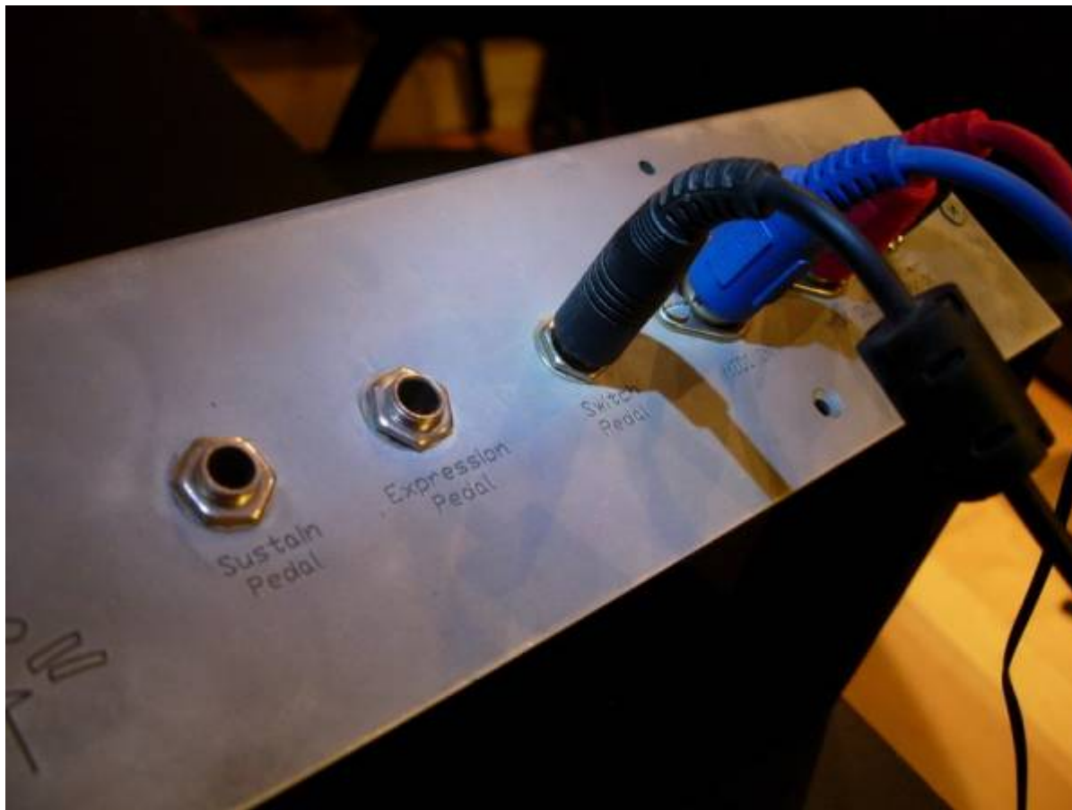
Sustain, expression, and switch pedal inputs; MIDI In/Out, power