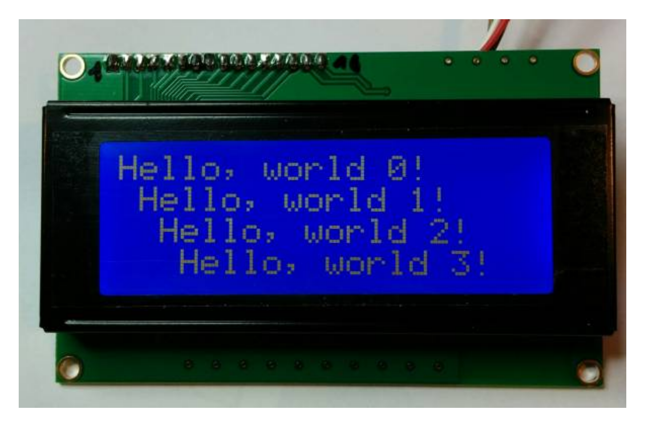
This is a 4x20 CLCD

An LCD module isn't an MBHP module, you buy the LCD screen with the PCB attached and driver chips on-board, and that is your LCD module. Here you can find information how to use an LCD with the Midibox MBHP Core module. See also: Troubleshooting LCD Displays