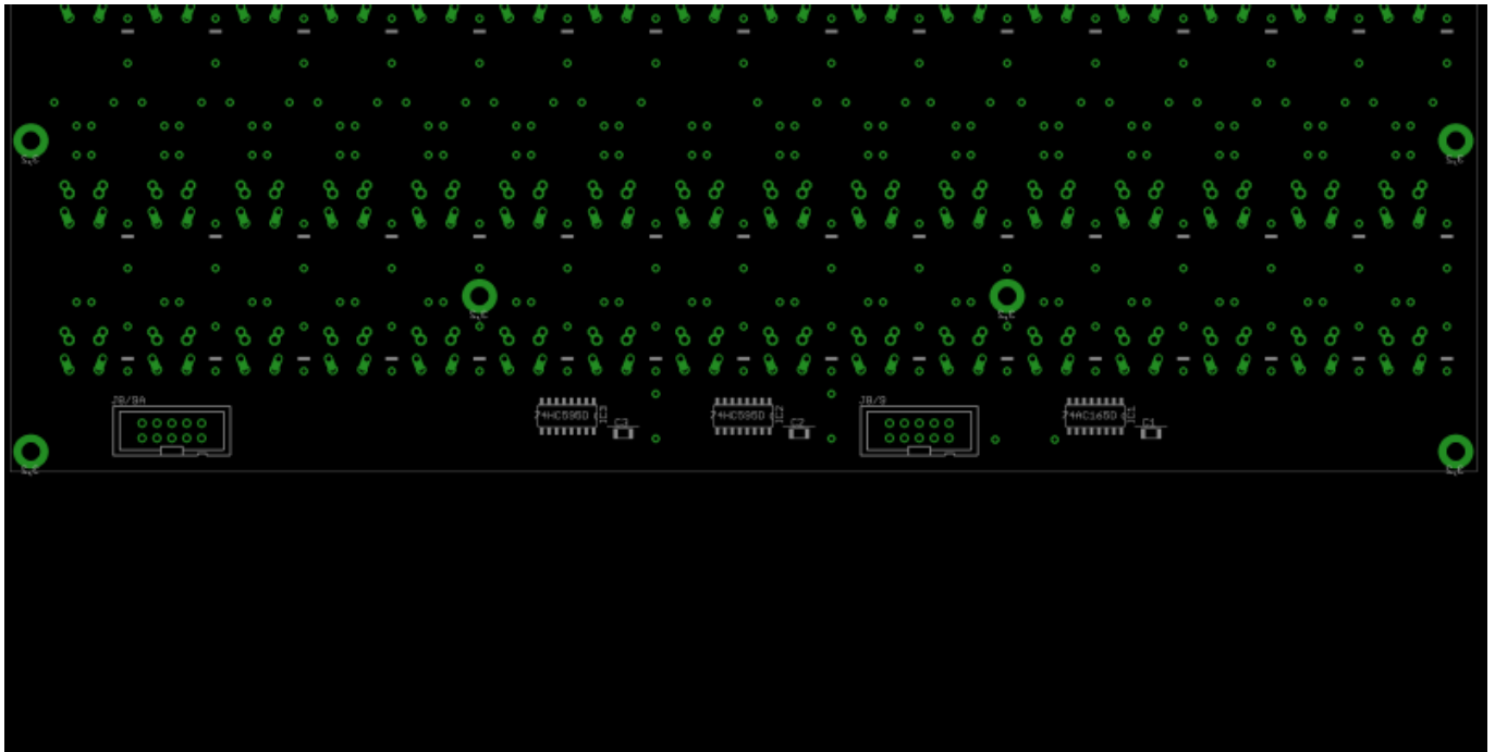
Rear placement of ICs (ignore the “AC” package, the correct CMOS family is 74 HC 165)