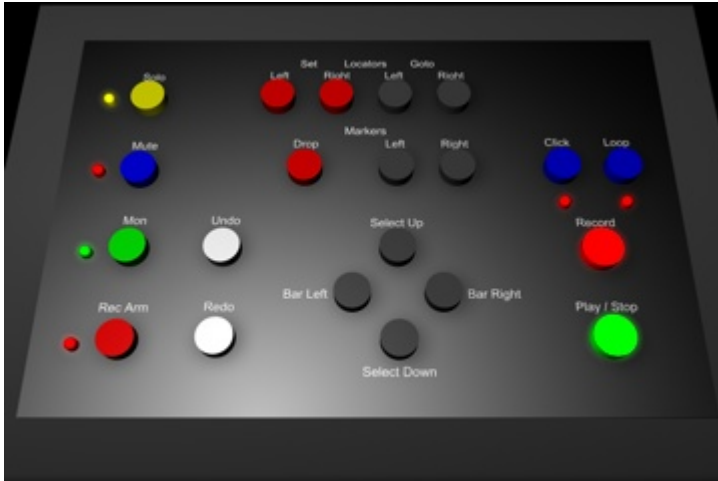
Render of what it might look like

The remote consoles will only have a DINx3 and a DOUTx3 inside. They will patch into the DIN/DOUT chain via Cat5 at the main console. Software is stock standard 64e.