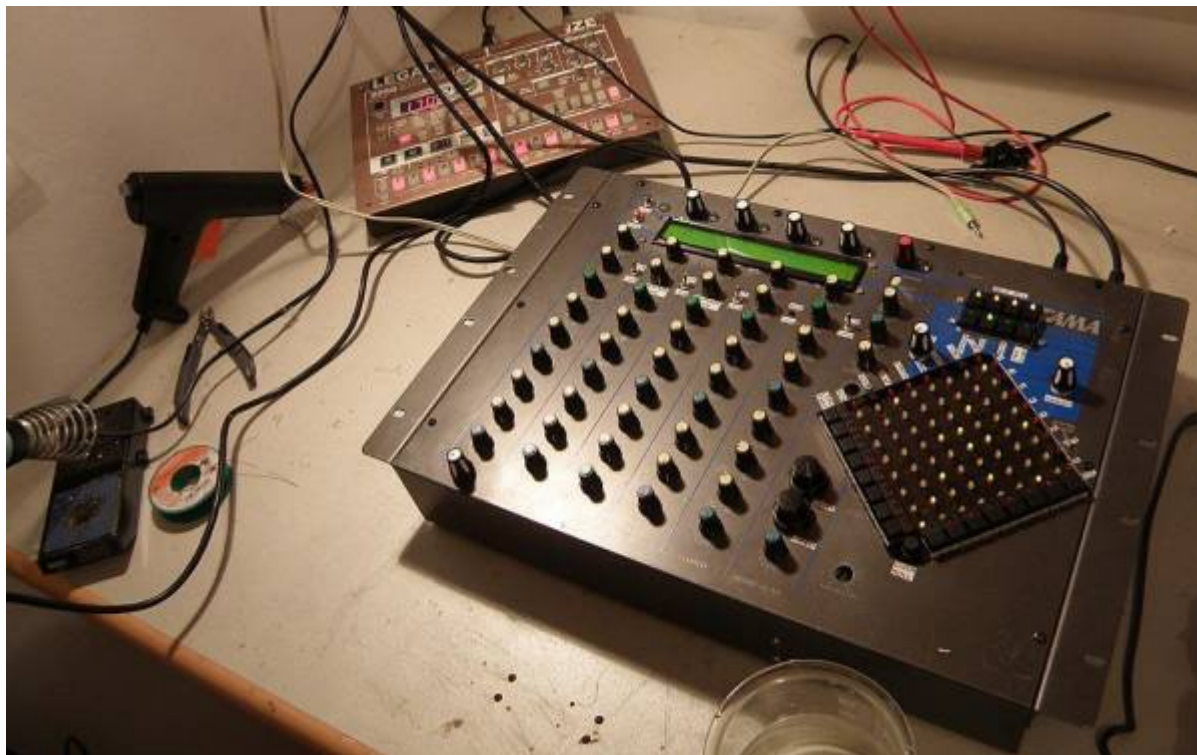
Tekkstar in use

it was a 8x8 LED-Matrix, with 2x8 Buttons, on Breadboard