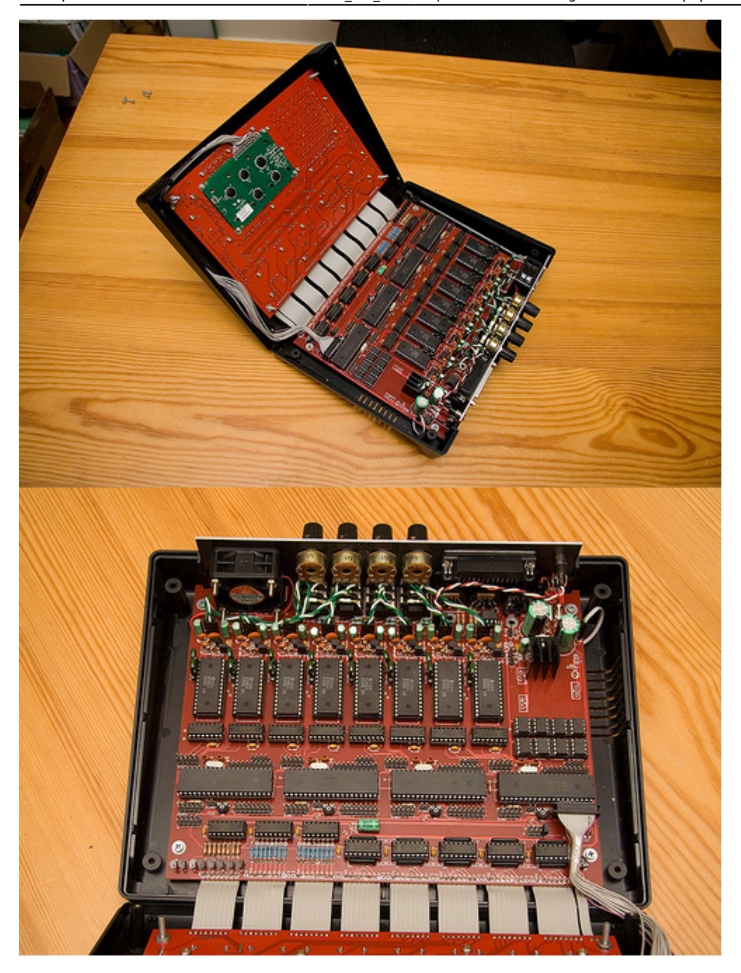
MB-6582 is a MIDIbox SID synthesizer.

If you have no idea what that is, look here: