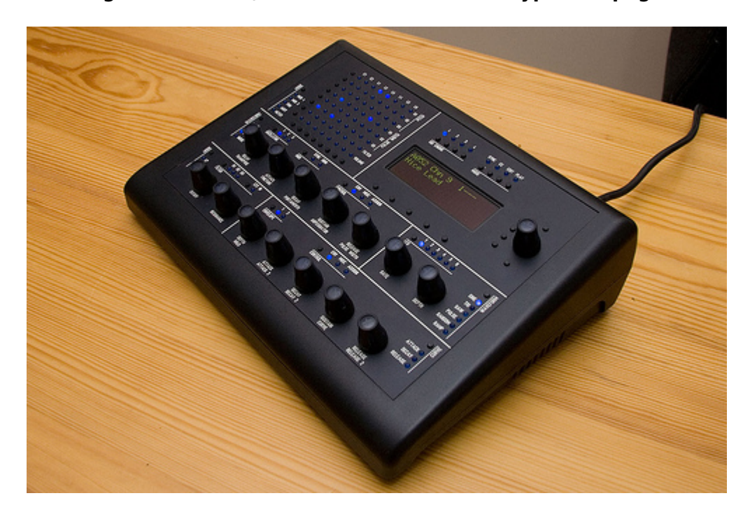
The MB-6582 Prototype

The Original MB-6582, aka. the MB-6582 Prototype (old pages)