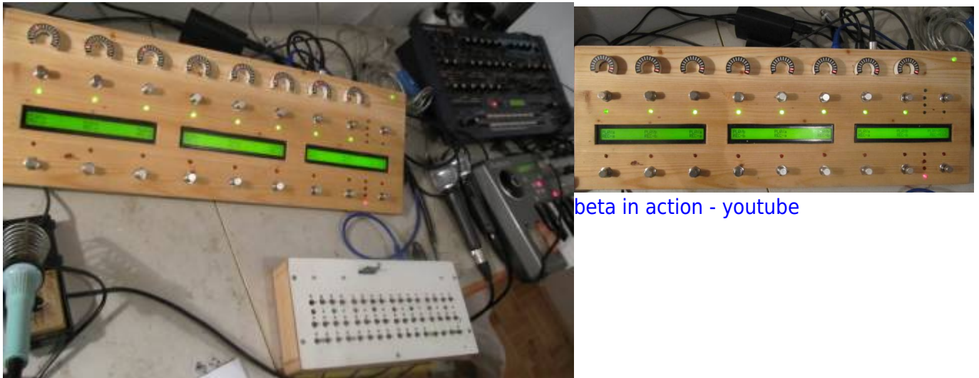
beta in action - youtube