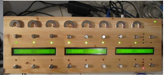
beta in action - youtube