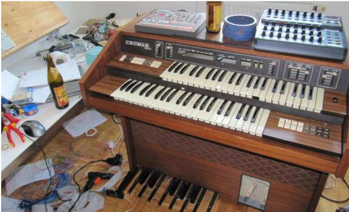
a other 32bit Variante built in on the other Upper-Manual in Crumar 198, UI-controlled via a BCR2000