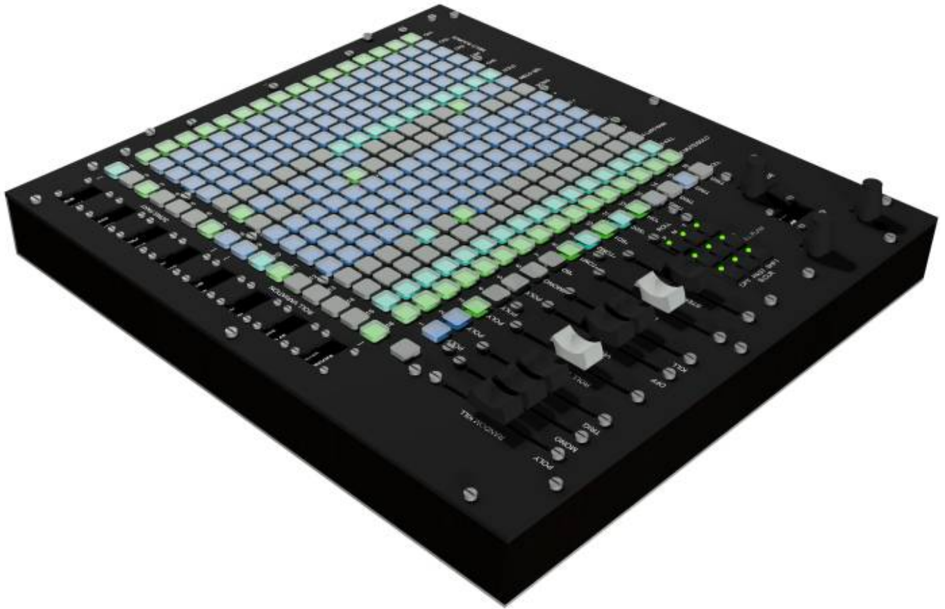
Left: Serial Nr1 « » Right: Prototype